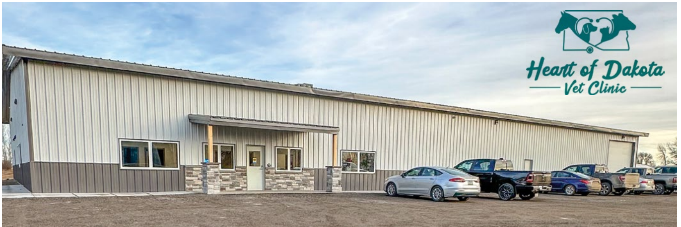
The Heart of Dakota Veterinary Clinic is located in Tappen.