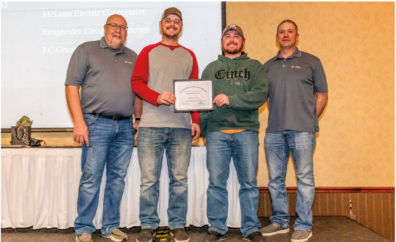
KEM Electric Cooperative employees accept a safety award on behalf of the cooperative, which recorded zero injuries for a one-year period.