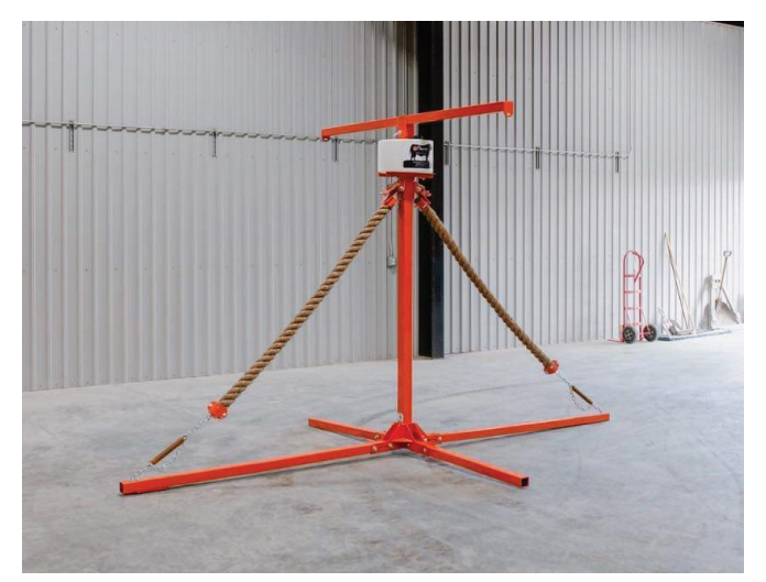
The cattle station is one of the items manufactured at Zimmerman Manufacturing.